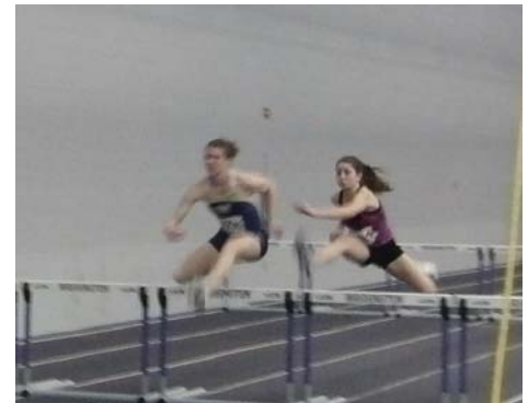
Photo: U. of Washington indoor, 60m hurdles, March 2011.