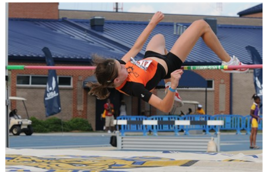
Photo: High jumping at the 2009 USATF Junior Olympic Nationals.